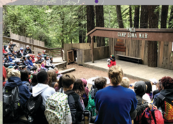
5th Grade Science Camp