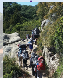
Middle School Outward Bound Program

ALL After School Explorers Enrichment Scholarships!